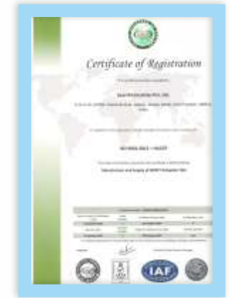
ISO 9001:2015 + HACCP